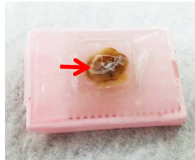
cracks upon or around the tissue