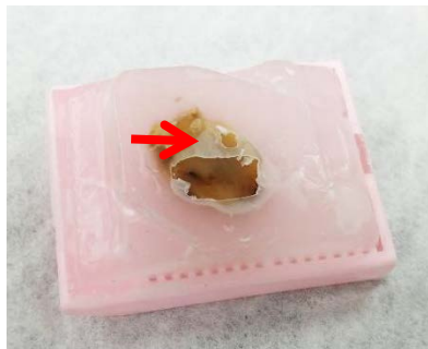
bubbles inside the blocks