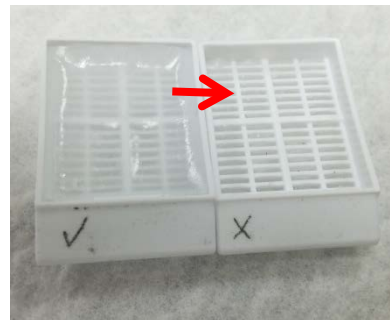
paraffin is not enough on the back of the cassettes